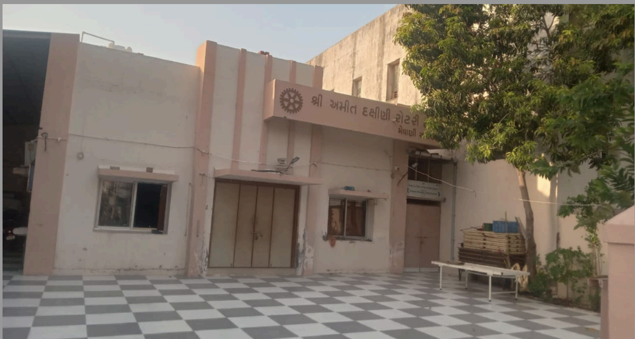
Rotary Hall , Vaadi Para , Surendranagar

It promotes goodwill and friendship by encouraging everyone to act in a high moral manner that is fair and beneficial to them. Many such projects are being carried out in the Rotary Club of Surendranagar. Including food distribution, health awareness, blood donation camp, eye checkup camp, Ayushfair etc. Sports related projects like Open Gujarat Chess Tournament and Couple Box Cricket Tournament. Entertainment related projects like Navratri or drama or no plastic awareness project for social awareness, mock test for SSC students to remove exam fear. Thus, projects covering every aspect of society are being carried out in the Rotary Club of Surendranagar, in which everyone from the club's president secretary to members, spouses and children participate with enthusiasm.