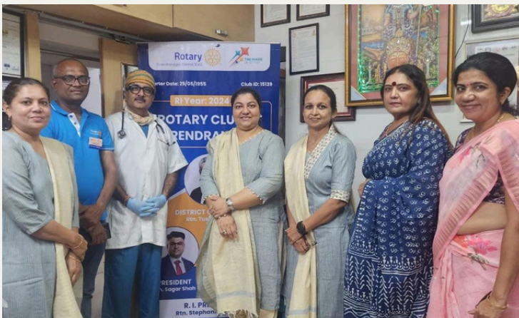
Cancer awareness project