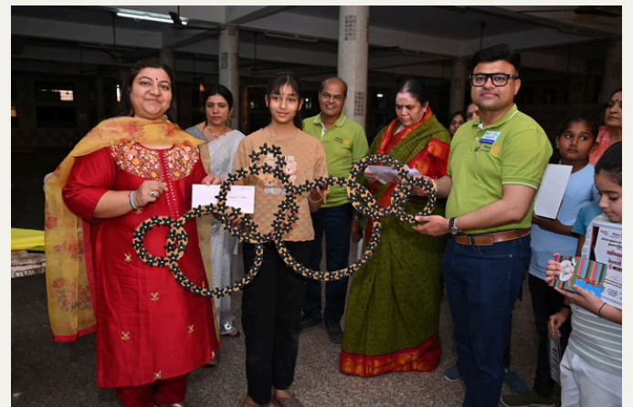
Best out of waste